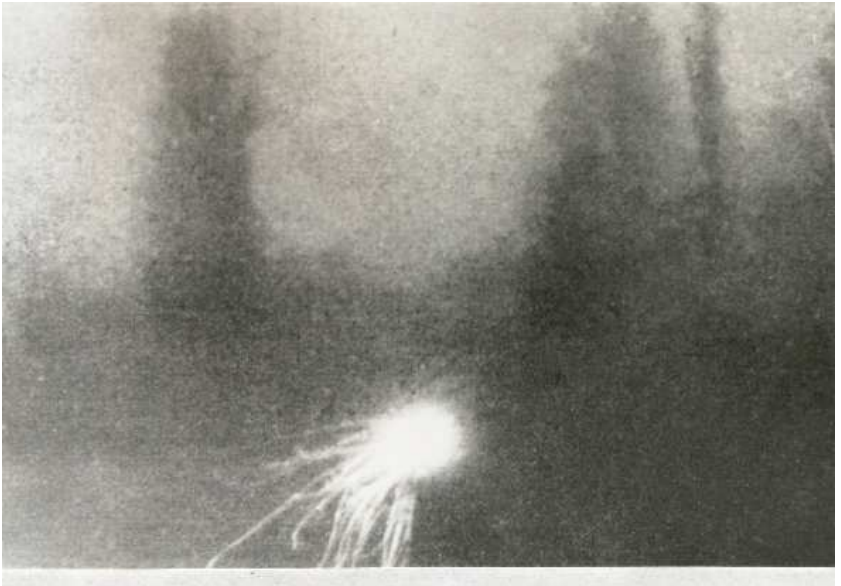
Fig. 2. Vergrößerter Bildausschnitt.

It has been found, that this model of a HF-plasma cavity was already published in 1969 by DAWSON and JONES in "Planetary Electrodynamics", New York, chapter VI-6 page 193 ff., where the authors made it quite clear, that the very strange phenomena of balllightning can only be explained by electrodynamic HF-physics. But concerning the also essential energy storage they made the wrong assumption, that the pressure of the microwave field can be in maximum only equal to the outer atmospheric pressure and that the stored HFenergy is thus consequently restricted by atmospheric pressure and ball volume. Their examples: 400 joules for a ball diameter of 10 cm and 10^4 joules for 30 cm, calculation results which are not quite understandable. But the authors didn't realize, that the atmospheric pressure is nearly irrelevant because high energy charged fire balls are put under massive pressure by strong surface tensions, self induced by enormous meridian oscillating HFcurrents, pinch-like strangling the circumference, and enormous HF-voltages pressing the "polar" zones, as described on page 3 of the present paper. And confronted in the discussion on their paper with the consequence, that their balls with any gas in it and therefore with densities nearly Zero should only rise like balloons without any chance for "floating around" the authors fell behind - almost helpless. Sure! The answer is given on page 4.